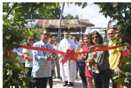
Opening of Branch office in Prosperidad, Agusan del Sur, on November 26, 2018