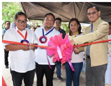
Opening of Branch office in Jordan, Guimaras on November 19, 2018

Also, PCSO inaugurated new branch office buildings in Cavite and Aklan to ensure that PCSO clients will be more comfortable while availing public services in the provinces.